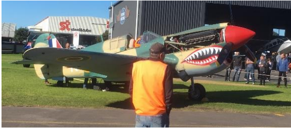
← Kittyhawk engine start